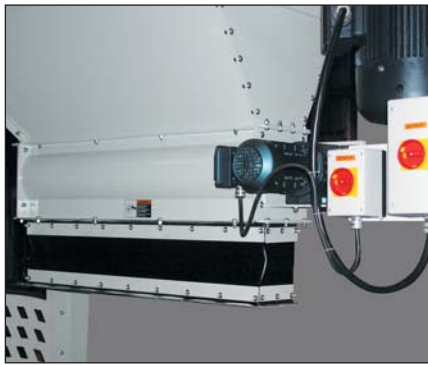
TOP PHOTO: FRONT VIEW OF THE FX-03-800CT DUST COLLECTOR. THIS MACHINE IS IDEAL FOR SOLID SURFACE, FINE LACQUER SANDING, COMPOSITE MATERIAL AND OTHER PROBLEMATIC WASTE MATERIALS.