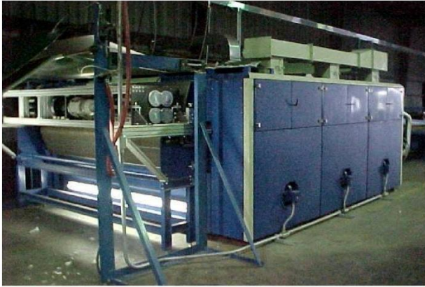
TYPICAL STRUTO PRODUCTION LINE